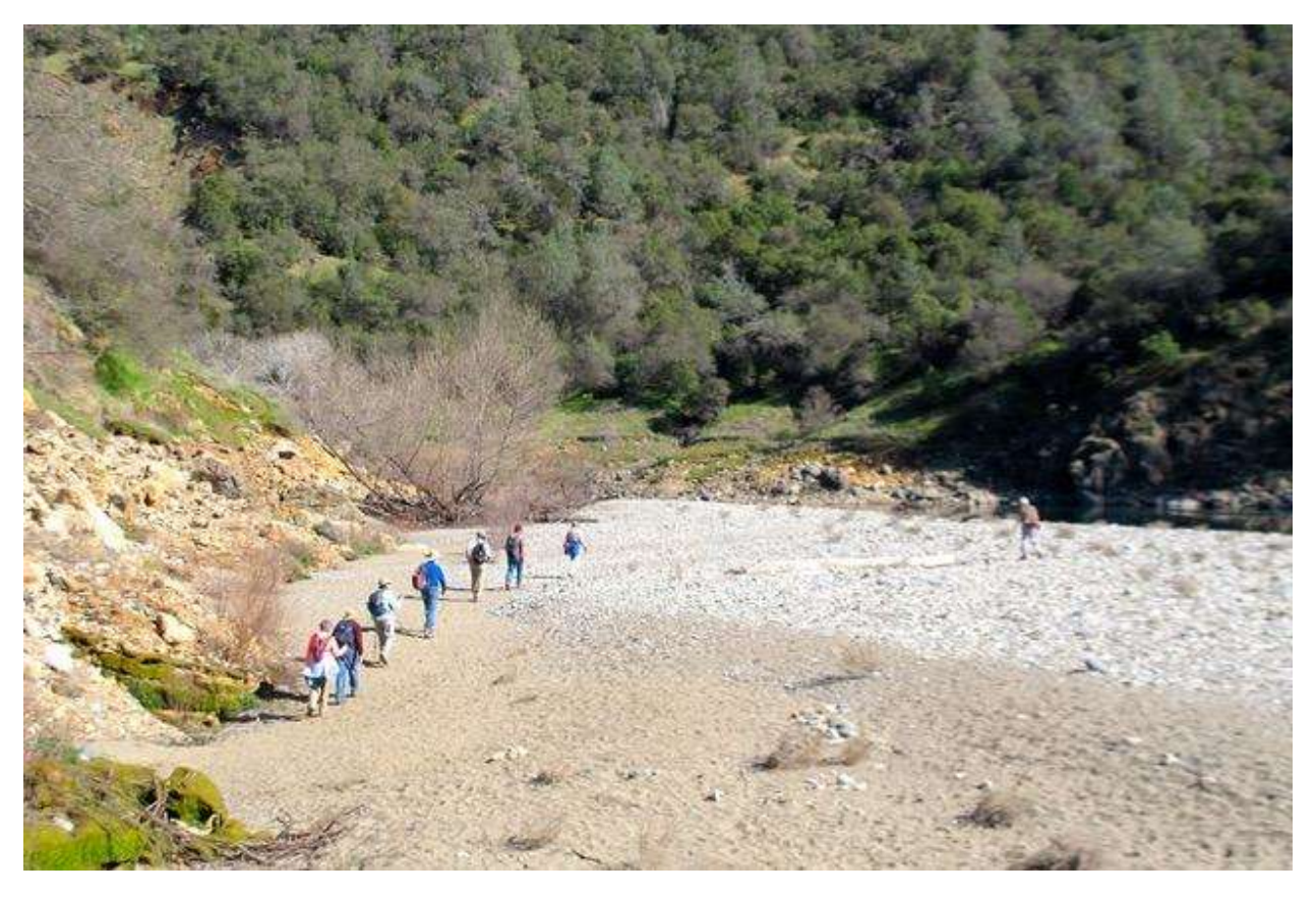
Tamaroo Bar access.