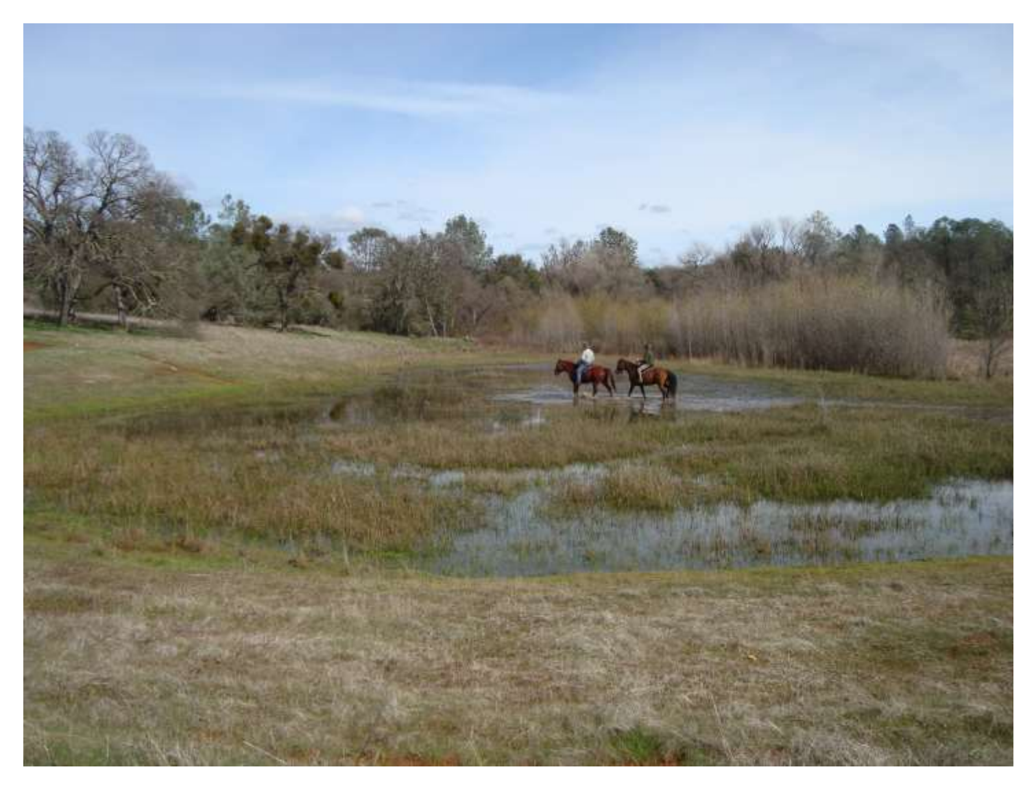
Part of Olmstead Loop, an equestrian paradise.