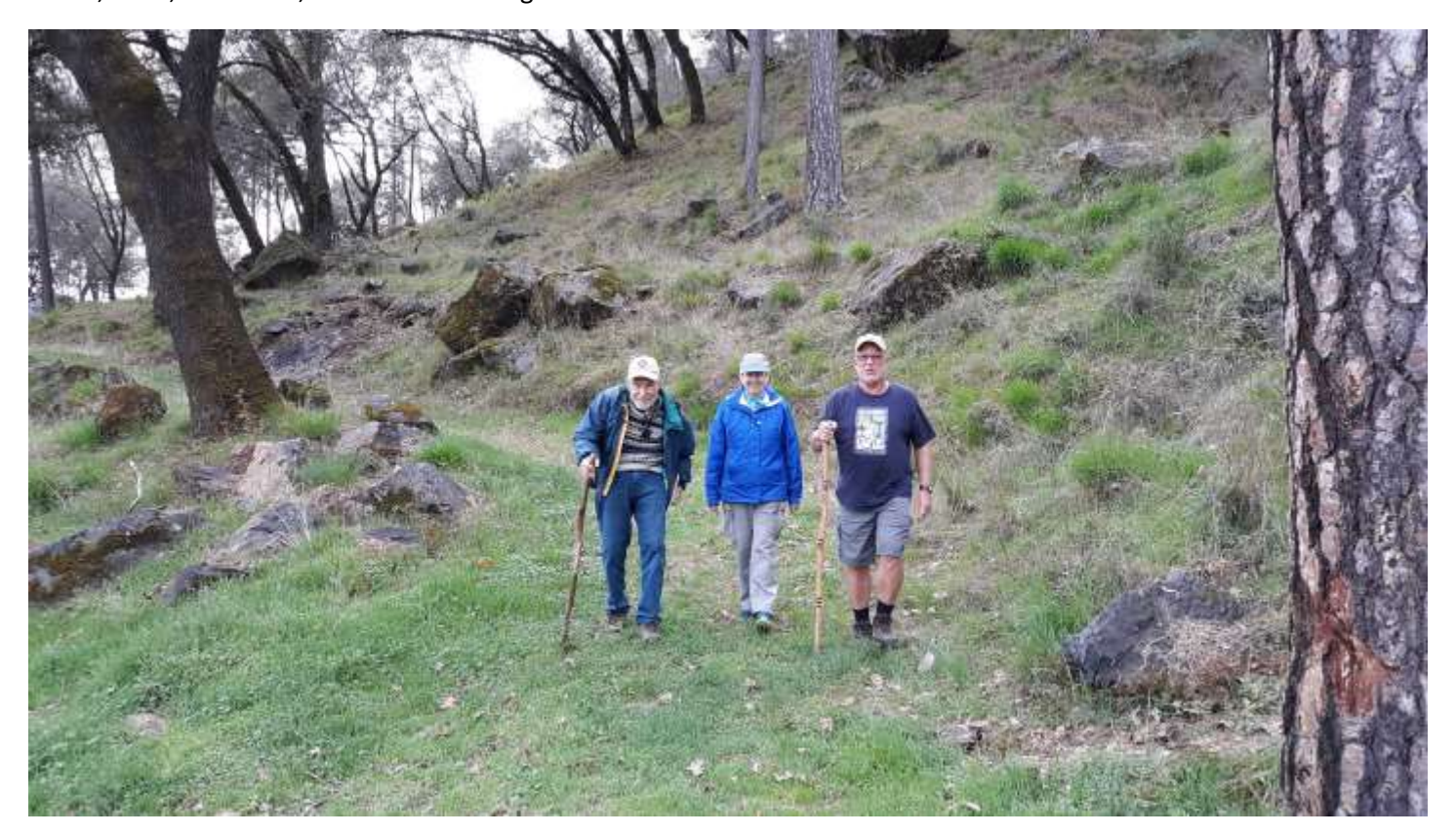
Enjoying a great day outside.