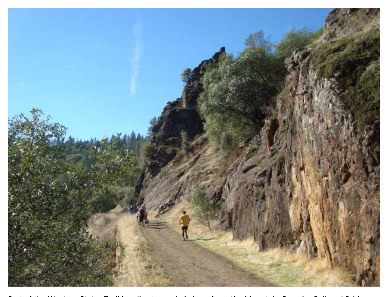
Part of the Western States Trail heading towards Auburn from the Mountain Quarries Railroad Bridge.